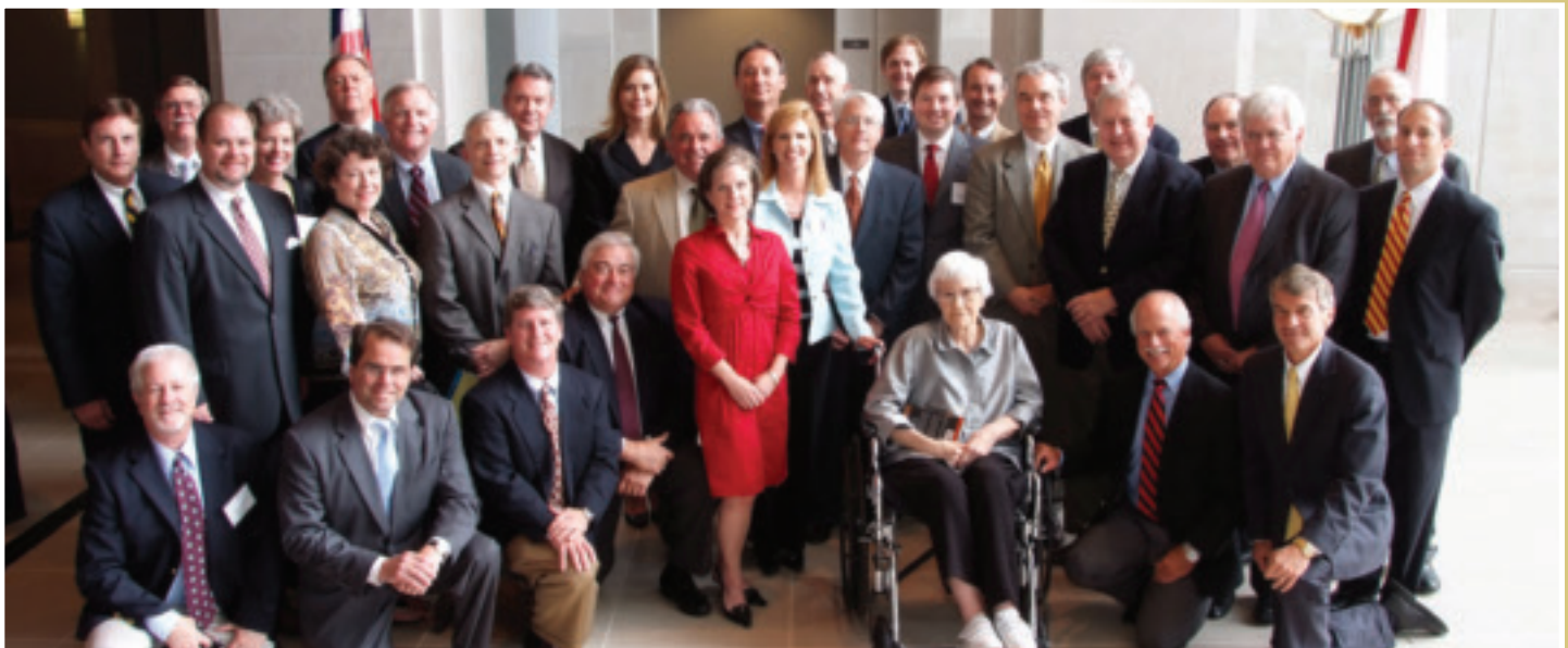
Members of the Board of Bar Commissioners pose with noted author Harper Lee at a special ceremony conducted during the induction of new members of the Alabama Lawyers Hall of Fame. She was honored with a one-of-a-kind honorary special membership in the Alabama State Bar which was unanimously approved by the supreme court. After receiving the award, Lee remarked, "I'm opening an office, tomorrow!" In 2006, Lee received the state bar's Award of Merit, presented for outstanding constructive service to the legal profession in Alabama.